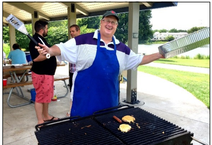
A great time was had by all at our annual picnic at Spring Lake Park in Aurora.